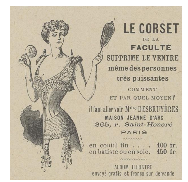
Figure 3: A French corset advertisement in 1899.