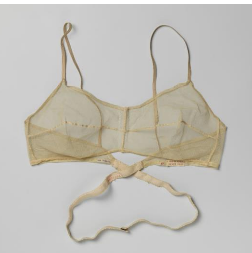
Figure 4: A Grisina bra at the Rijskmuseum in Amsterdam. The model has two elastic straps intended to be crossed at the back and fastened at the front, allowing the deep necklines in the back, typical of dresses of the time, to be left free, c. 1925.

So, together with her sister, she set up a home-based fashion workshop where she put into production what she called the Grisina Invisible Bra. The business was an immediate success in the international fashion scene. (Figure 4)